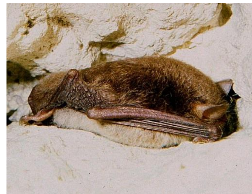
Daubenton's Bat.